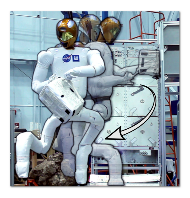
Fig. 1. R2 executing the CTB retrieval scenario. R2 has to respect many different constraints when planning motions along the course of the operation. For example, when holding the CTB with both hands, there is a constraint imposed on the hands as to not drop the CTB. The system allows consideration of constraints such as the example given and provides means for the operator to easily specify novel ones without leaving the high-level interface. There are four stills superimposed in this image, from back to front: R2 approaching the cargo rack, R2 unbuckling the restraint holding the CTB, R2 grabbing the CTB with both hands, and the final image of R2 bimanually manipulating the CTB.

Robonaut 2 (R2), shown in Figure 1, is a complex humanoid robot capable of dexterous manipulation [1]. It is composed of an anthropomorphic upper body and two leglike appendages that each feature seven degrees-of-freedom, for a total of 34 degrees-of-freedom in the main body. Its twelve degree-of-freedom hands can execute dexterous manipulation tasks like using human tools and handling fabric surfaces [2]. The end-effector on the legs has a multi-purpose gripper that can attach to the ubiquitous handrails in the International Space Station (ISS). R2 is designed to be an assistant to the crew currently stationed on-board the ISS, as well as a test-bed for robotic caretaker technology that is required in future space exploration [3]. Repetitive and dangerous operations required for space exploration could be accomplished by R2 and other robots, allowing more time for astronauts to achieve scientific mission objectives. For example, the logistics and organization of cargo takes an immense fraction of crew time and is physically strenuous. In future space exploration, robots like R2 could unload a dormant logistics module for a spacecraft in cislunar orbit in advance of crew arrival. On the ISS today, cargo is stored within a general purpose container called a Cargo Transfer Bag (CTB). R2 could retrieve and manipulate a desired CTB